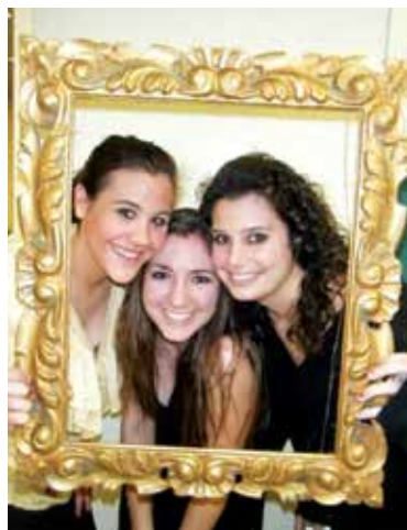
The Princess Bride submitted by Rachael (Marino) England (Class of 2009)