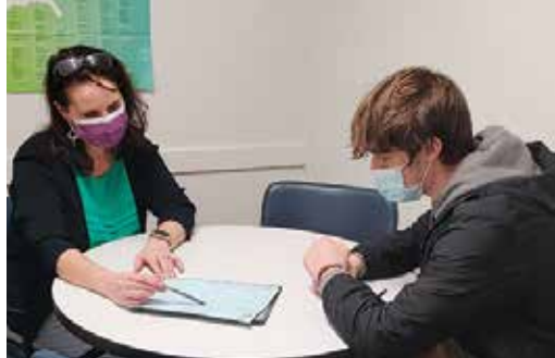
Providing one-on-one counseling

The college application and selection process is a very personal process.