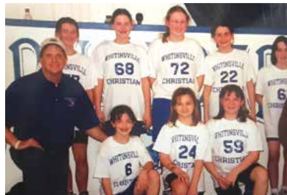
Youth hoops submitted by Nicole Wieggers (Class of 2014)