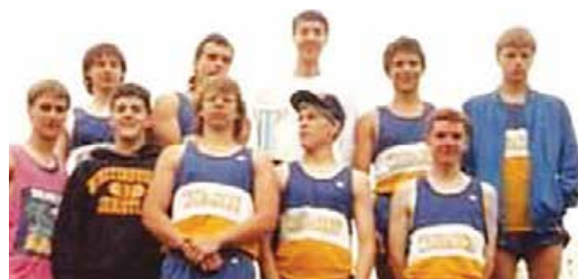
Track and field 1990 submitted by Ruth (Wynja) Gibbons (Class of 1991)