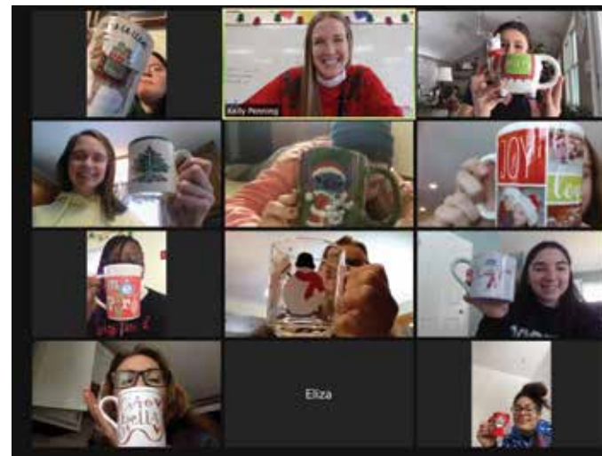
Lunchroom friends stay connected on remote school days.

I have felt privileged and blessed to have so much personal contact with many of our students in 1:1 meetings, small