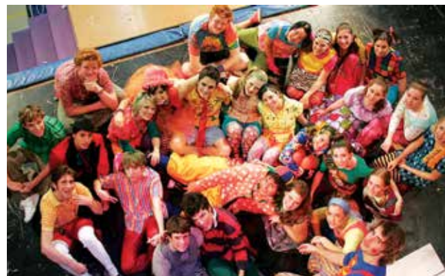
Godspell 2006 submitted by Amy Partridge (Class of 2006)