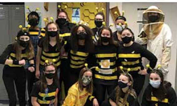
High school students decorated their lunch rooms